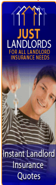
Link 3: (160x400 Rent Guarantee)

Follow the Above Link By Clicking Below :